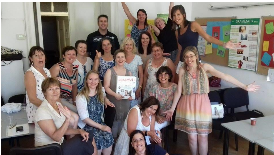
Greetings from the international BEATS team of teachers and coordinators (here: gathered in Rijeka, Croatia)!

The course consists of 80 lessons (depending on the institution, at least 40 lessons in the classroom + up to 40 lessons of individual work, supported by the online Moodle environment).